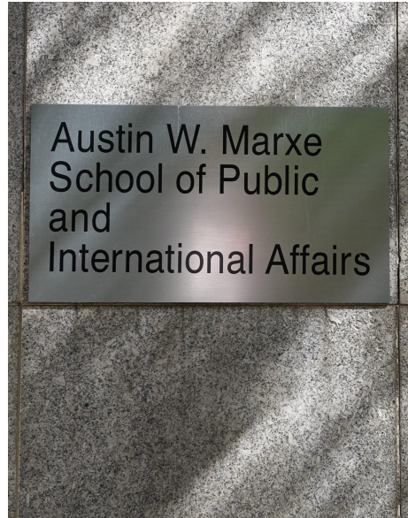
Marxe School of Public and International Affairs