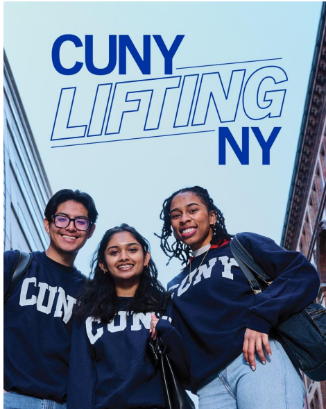
City University of New York