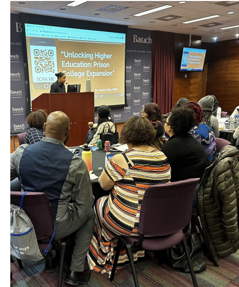
Higher Education Administration Program